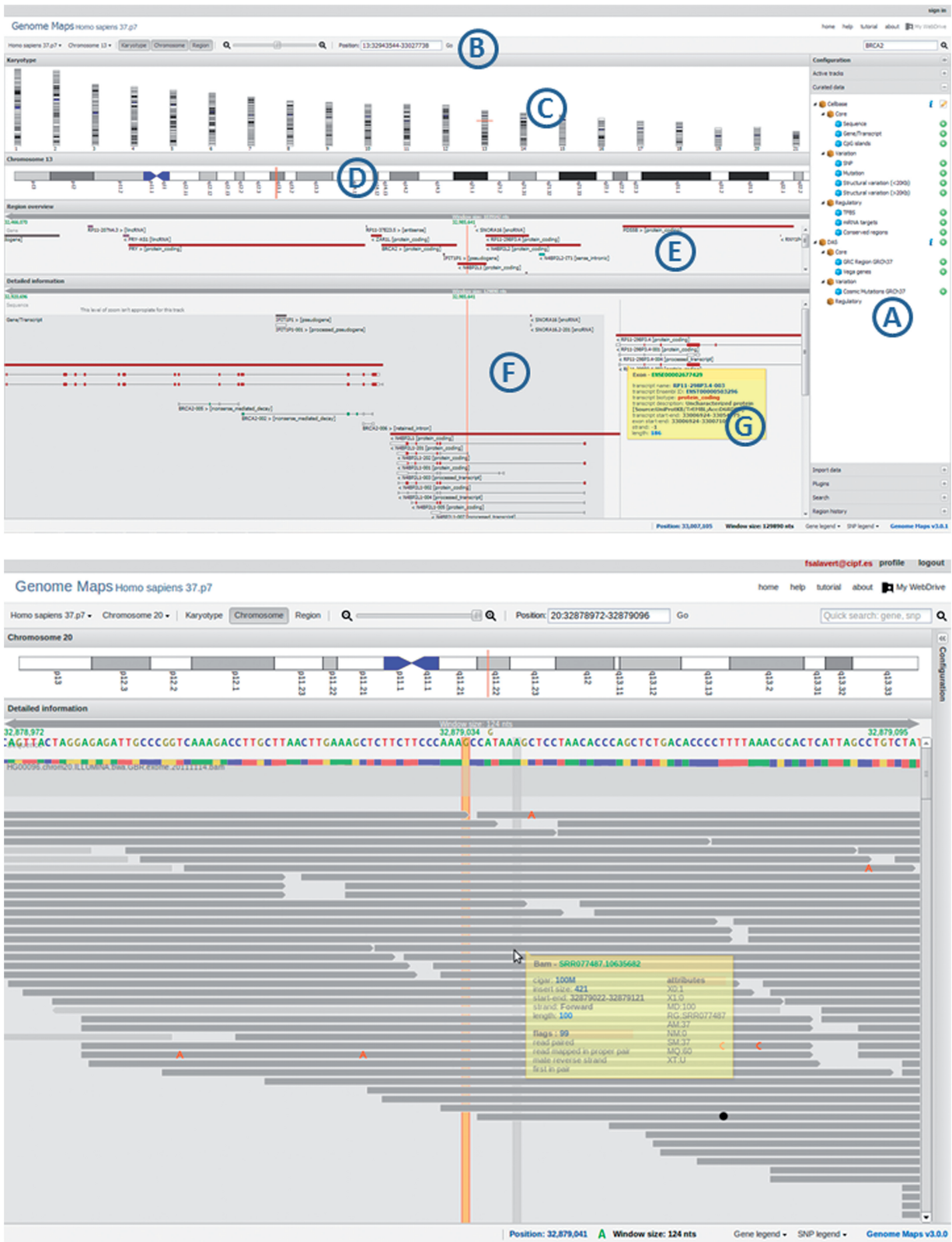
Figure 1. The upper part of the figure represents a screenshot of the Genome Maps interface showing all the information provided by the browser. In the lateral collapsible menu bar (A) tracks or DAS servers can be activated, also plug-ins are found there. In the navigation bar (B) the controls to move to different genomes, zoom or locations are found. ‘Karyotype’ (C), ‘Chromosome’ (D) and ‘Region Overview’ (E) panels show different resolution levels of information. The ‘Detailed information’ (F) panel displays all the tracks. By default sequence, genes and SNPs tracks are activated. Setting the cursor over an element pops up a window with relevant information (G). The lower part of the figure represents another screenshot of Genome Maps with a BAM file with the zoom at base resolution detail. The status bar shows some useful information such as genomic position or color legends. Here, the right-hand menu bar has been hidden.