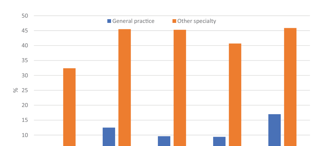
Figure 2. Proportion (%) of GPs and doctors in other specialties in different age groups having started or completed a doctorate.