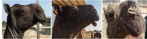
Fig. 1. Papillomatosis in dromedary camels in Al Ahsa, Saudi Arabia. Cauliflower-like and multiple nodular Papillomas on the face that vary in number and size.

The two animals in group I, belonging to a dromedary camel farm in Riyadh region of central Saudi Arabia, showed numerous nodular and cauliflower-like proliferations on the lips and nostrils, which had first been noticed 4 weeks prior to sampling. In group 2, the disease occurred in epizootics form involving 14 (Table 1) out of 81 dromedary camels, giving a morbidity rate of 17.3%. The number of warts per animal varied from one to 20, with a size ranging from 0.3 to 2.2 cm. They were particularly located on the lips, eyelids, nostrils and mandible (Fig. 1). The lesions first appeared as rosy hyperemic elevations of the skin and developed into solid cauliflower-like exophytic growth taking the skin or a darker colour in the majority of the animals. The cauliflower-like papillary masses were dark in color with approximate size of 2 cm in diameter (Fig. 2).