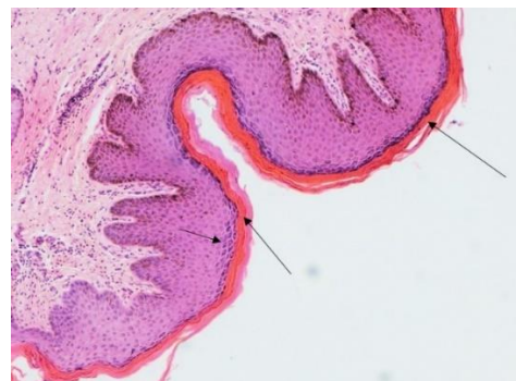
Fig. 3. Skin section of camel, showing hyperkeratosis (long arrows), hydropic degeneration of keratinocytes, acanthosis (short arrow), and mild infiltration of inflammatory cells.

Possible PV genomic amplification by RCA was observed for samples Rm1 and Rm2. These RCA products were submitted to degenerate primer PCR, and PV specific sequences could be amplified for all these samples (Table 3).