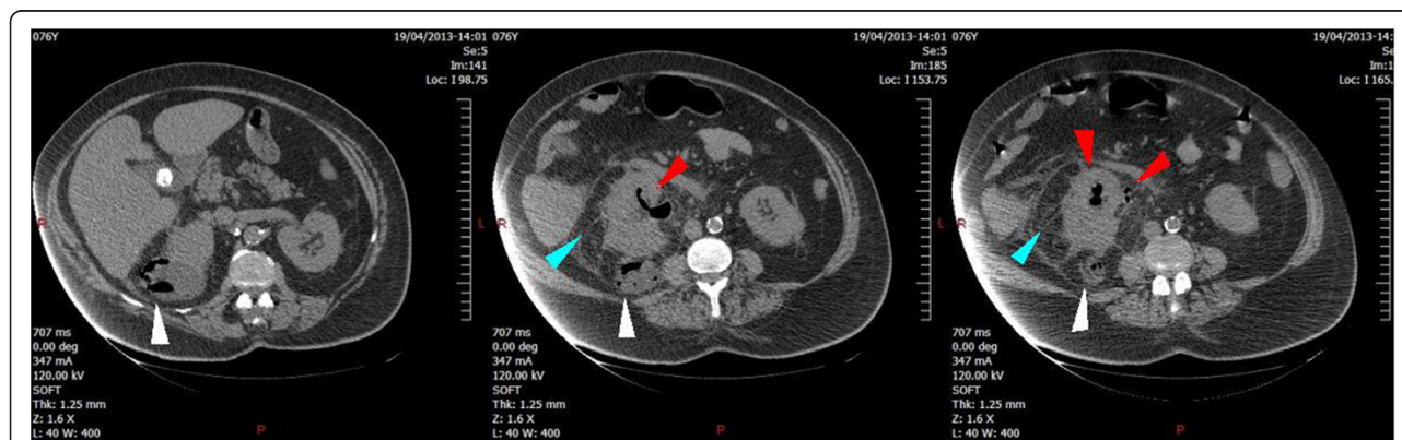
Figure 1 Emphysematous pyelonephritis (EPN) of the right kidney. Computed tomography scan demonstrates right-sided EPN with enlarged right kidney and normal left kidney. Gas is present in the renal pelvis, in the proximal ureter (red arrows), and in a posterior cyst of the right kidney (white arrows). There is also significant perirenal infiltration (blue arrows).

Microscopic examination of urine collected by cystoscopy from the right pelvi-caliceal cavity showed presence of pyuria, Gram stain detected gram-positive bacilli, and culture was positive with A. meyeri 10^5 CFU/mL with the use of Vitek 2 ANC card (bioMérieux, Marcy l'Etoile, France). Antibiotherapy was finally switched to amoxicillin 2 g \times 3 per day according to the antibiogram for a duration of 3 months against A. meyeri . As advised by our infectious disease specialists, ofloxacin (200 mg twice a day) was maintained for 21 days covering a hypothetical non-diagnosed coinfection with gram-negative bacilli.