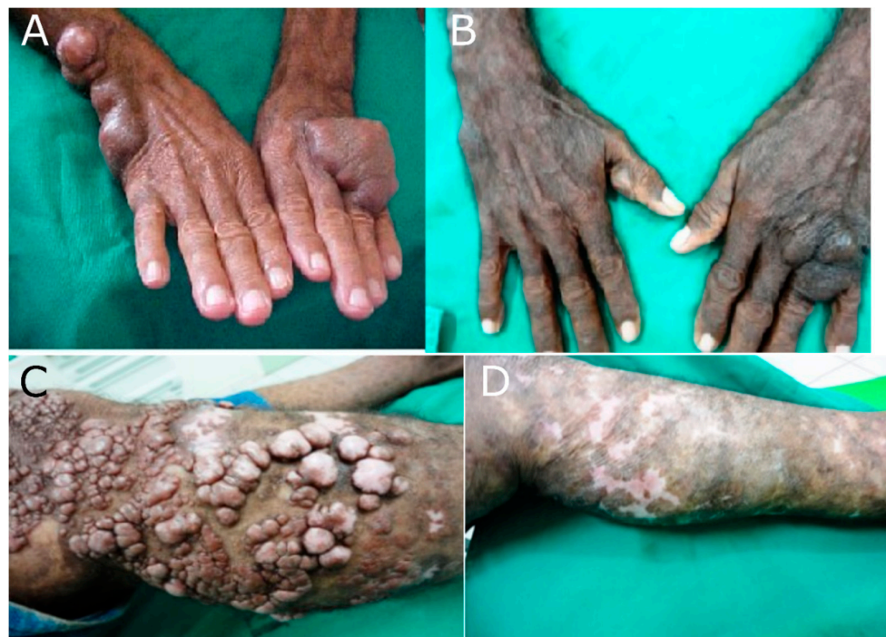
Figure 1. WHO/MDT/MB standard protocol for lobomycosis treatment, SDPA, Acre state, 2020 [71]. (A) localized lobomycosis before and (B) after WHO/MDT/MB treatment for four years. (C) disseminated lobomycosis before and (D) after WHO/MDT/MB treatment for four years plus lesion resection twice a week for one year.

*: doses are in grams (g) and daily, except when informed in months (m). @: duration of treatment in days (d), months (m), or years (y). %: Follow-up time after the treatment’s end. #: outcomes of skin lesions: 1 = no resolution, 2 = partial resolution, and 3 = clinical cure. #: outcomes of fungal viability: A = unchanged; B = decreased; and C = clinical cure. $: side effects: Yes 1 = skin pigmentation due to the use of clofazimine; Yes 2 = headache.