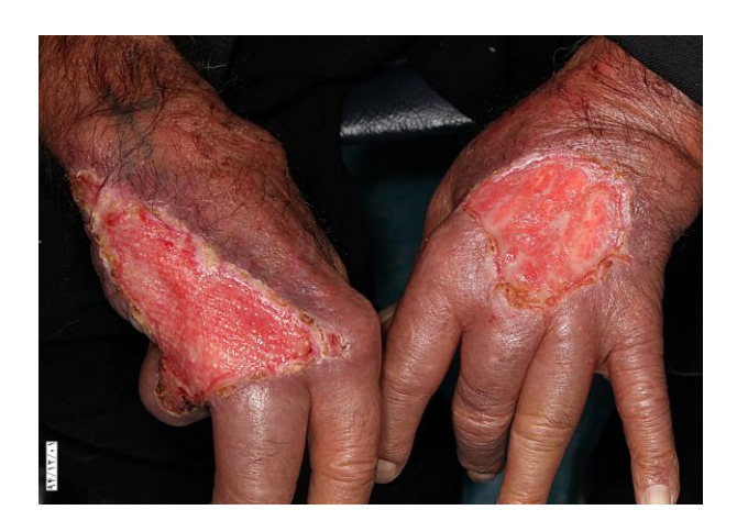
Fig. 5: Significant treatment of lesion by meglumine antimoniate