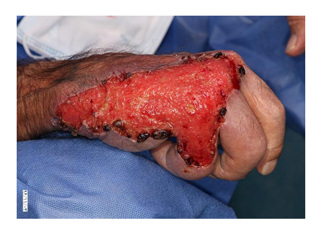
Fig. 2: Ulcerative lesion on the right hand

During the past 3 yr, the lesions of hands were so developed that destroyed the tendons and soft tissue of fifth finger in the right hand so led to amputation of this finger. There was no history of comorbid condition, drug consumption, systemic symptoms, weight loss, fever, lymphadenopathy, hepatosplenomegaly or any signs of systemic involvement in physical examination and laboratory survey.