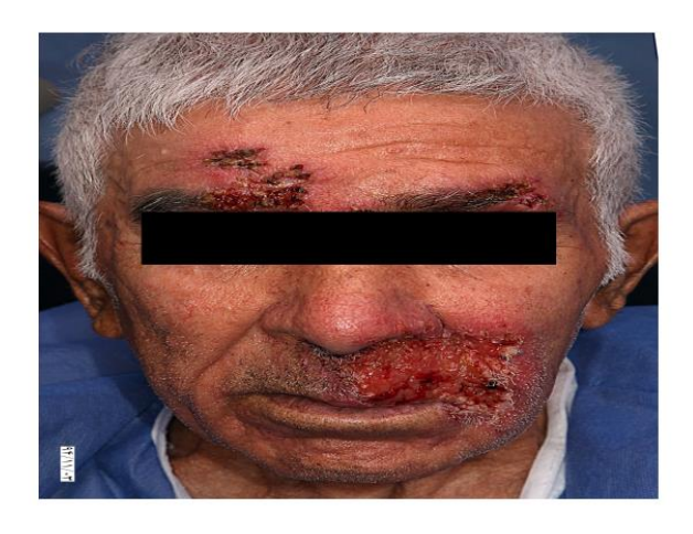
Fig. 1: Mucocutaneous lesions on the face

Informed consent was taken from the patient.