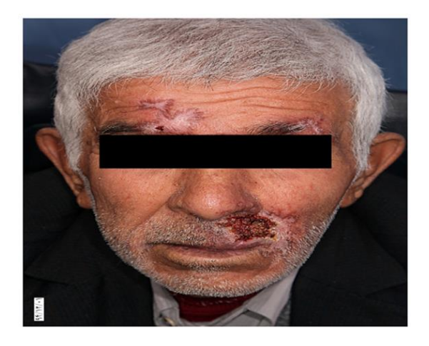
Fig.4: Significant treatment of lesion by meglumine antimoniate

The patient was informed about publishing his figures whit covering eyes.