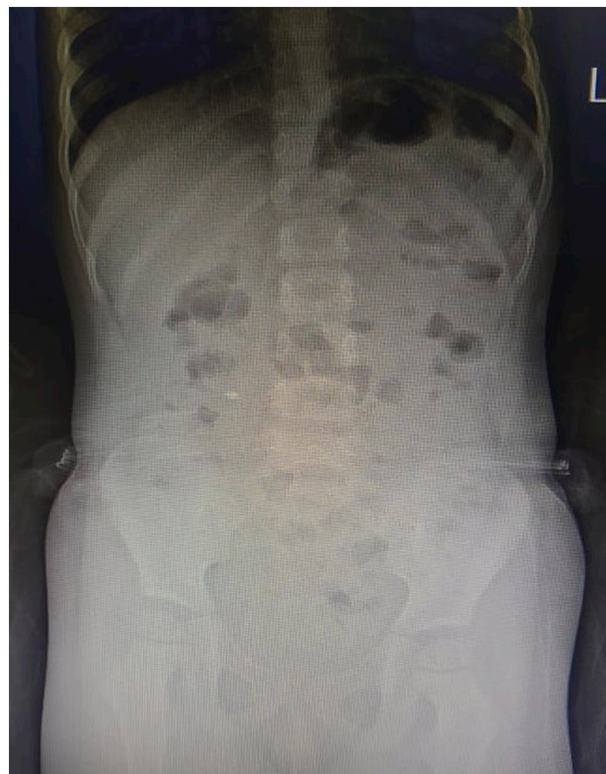
Fig. 2. Resolution of Chilaiditi's sign at one month radiograph.

CS first described by Demetrius Chilaiditi in 1910 is an uncommon radiological finding with a global incidence of 0.25–0.28% and poorly understood etiology [2]. Seemingly more common in adults, mostly men (Male:Female = 4:1) it tends to present at a median age of 60 years [2]. It is commonly described over the right side than left [2,3]. This may represent one of the few cases of left sided CS reported globally in a child