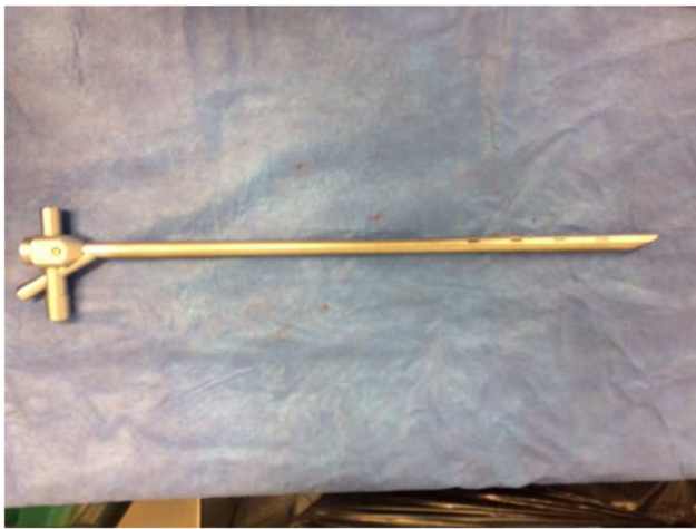
Figure 1. Rigid bronchoscope. This figure is an original image taken in ED's clinic for this publication.

The first indication for the use of bronchoscopy was foreign body removal. Gustav Killian used a metal pipe to remove a pork bone from a farmer's lung in 1897. This was done with