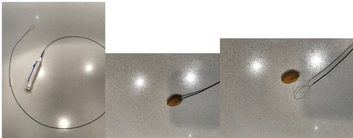
Figure 2. Zero Tip Airway Retrieval Basket (Boston Scientific, Marlborough, MA, USA). a. Zero Tip Basket b. Almond trapped in Zero Tip Basket c. Almond and Zero Tip Basket side by side. This figure is an original image taken in the author's clinic for this publication.

The sample obtained allows diagnosis, staging, and molecular testing for advanced malignancy. This is used for lung cancer but also for metastatic cancer to the lungs from other primaries.