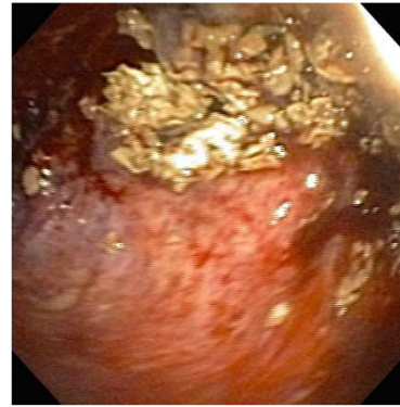
Figure 6. Endoscopic view of an intracavitary aspergilloma. This figure is an original image taken in the author's clinic for this publication.

Bronchoscopy has improved many lives. It offers a good combination of diagnostic and therapeutic options for a variety of lung diseases. It has led to the new medical field of interventional pulmonary medicine, in which training is oriented toward mastering all of the different bronchoscopic procedures. As the technology improves, there will be new tools and