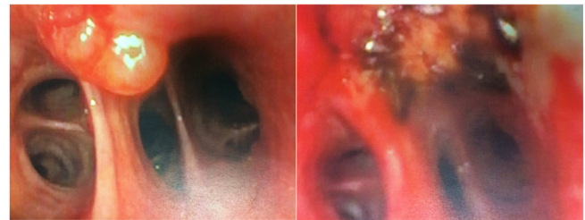
Figure 5. Before (left) and after (right) treatment of a mucoepidermoid carcinoma with electrocautery through flexible bronchoscopy. There was no recurrence at 5 years. This figure is an original image taken in the author's clinic for this publication.

vasculitis or other vascular diseases, lung cancer, bronchiectasis, and trauma. It is often a situation that can be stressful for both the patient and the pulmonologist. Bronchoscopy, most commonly rigid bronchoscopy, can be helpful to determine the location of the bleeding and can allow the protection of the airway. Patient ventilation can be maintained through the rigid bronchoscope while the bleeding is concealed. Often, it will not provide a permanent treatment, but it can temporize the bleeding and stabilize the patient until the definitive treatment is applied. Balloons and bronchial blockers are of great help in isolating the bleeding 6 .