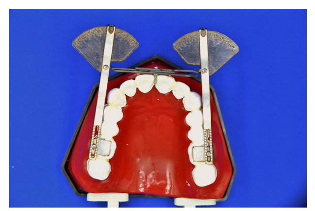
Figure 2. The inclinometer can be used on the stone models and in the oral cavity.

The CT technique for measuring intermolar torque has many disadvantages, including high cost, exposure to x-ray, and low validity.<sup>9</sup> Coronal slices that can be used to measure intermolar angle are in a