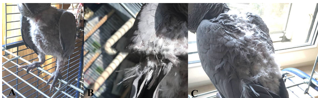
Figure 2 Deplumation area in feather damaging behavior African grey parrots. (A) Chest area; (B) wings; (C) shoulders and rump.

The mean recovery rate of corticosterone added to dried excreta was 95.8%. According to the manufacturer, the corticosterone kit presents the following cross reactivity: 100% with corticosterone, 12.3% with desoxycorticosterone, 0.62% with aldosterone, 0.38% with cortisol and 0.24% with progesterone. The concentration of CM was expressed as ng/g of droppings dry matter.