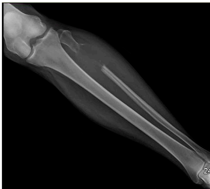
Figure 3. Bone survey demonstrated lytic lesions in the left proximal fibular diaphysis.