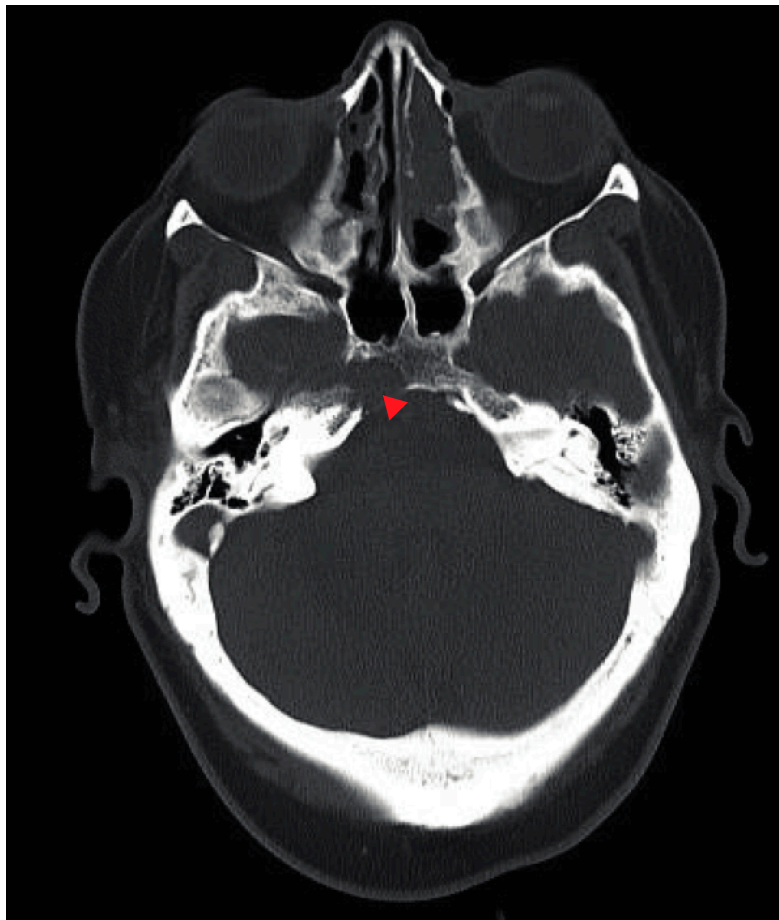
Figure 1. Axial CT head demonstrating lytic bone lesion (indicated by red triangle) within the right side of the clivus adjacent to Dorello's canal likely accounting for the patient's 6th nerve palsy.