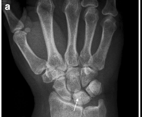
Fig. 1 Radiographs demonstrating a solitary amorphous calcification at the volar site of the right wrist adjacent to the proximal carpal row (b, arrow). There are no signs of erosions or carpal malalignment. Note the slightly sclerotic lunate bone (a, arrow)

Based on clinical and radiological findings, the diagnosis of HADD-associated carpal tunnel syndrome was made and treatment with non-steroidal, anti-inflammatory drugs (NSAID) was started. The patient's symptoms decreased within 2 weeks. Surgical release of the retinaculum flexorum was therefore not necessary.