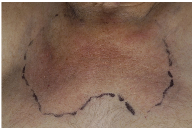
Figure 1 Clinical appearance of cellulitis overlying both sternoclavicular joints in association with septic arthritis.

Over postoperative days 12 and 13, the patient developed diarrhoea with intermittent pyrexia and raised inflammatory markers (erythrocyte sedimentation rate 94 mm/hour, C-reactive protein 112 mg/l, WBC 21.3 \times 10^9 /litre). At this stage the cellulitis around the site of the previous CVC was noted to extend anteriorly over the sternum, and both peripheral blood cultures and the cultured CVC tip grew methicillin-resistant Staphylococcus aureus (MRSA), which was sensitive to vancomycin, gentamicin, rifampicin and tetracyclines, prompting treatment with intravenous vancomycin. A duplex ultrasound of the upper limb and neck veins was performed in order to exclude a subclavian venous thrombosis; however, an