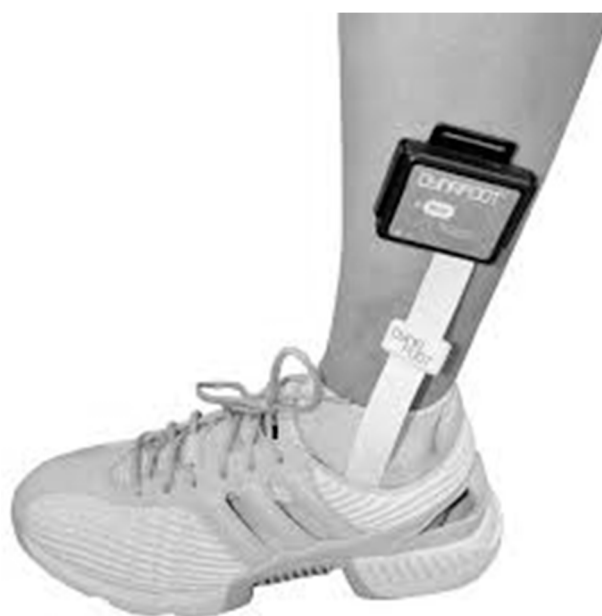
Figure 2. Foot pressure analysis system.

The speed, guidance force, and body-weight support during the RAG training were adjusted based on the therapist's decision in accordance with the individual conditions of the patients to achieve patient comfort. In this study, the RAG device's speed was adjusted to the same as the 10 m walking speed, with IOGG, guidance force, and body-weight support were set to a minimum.