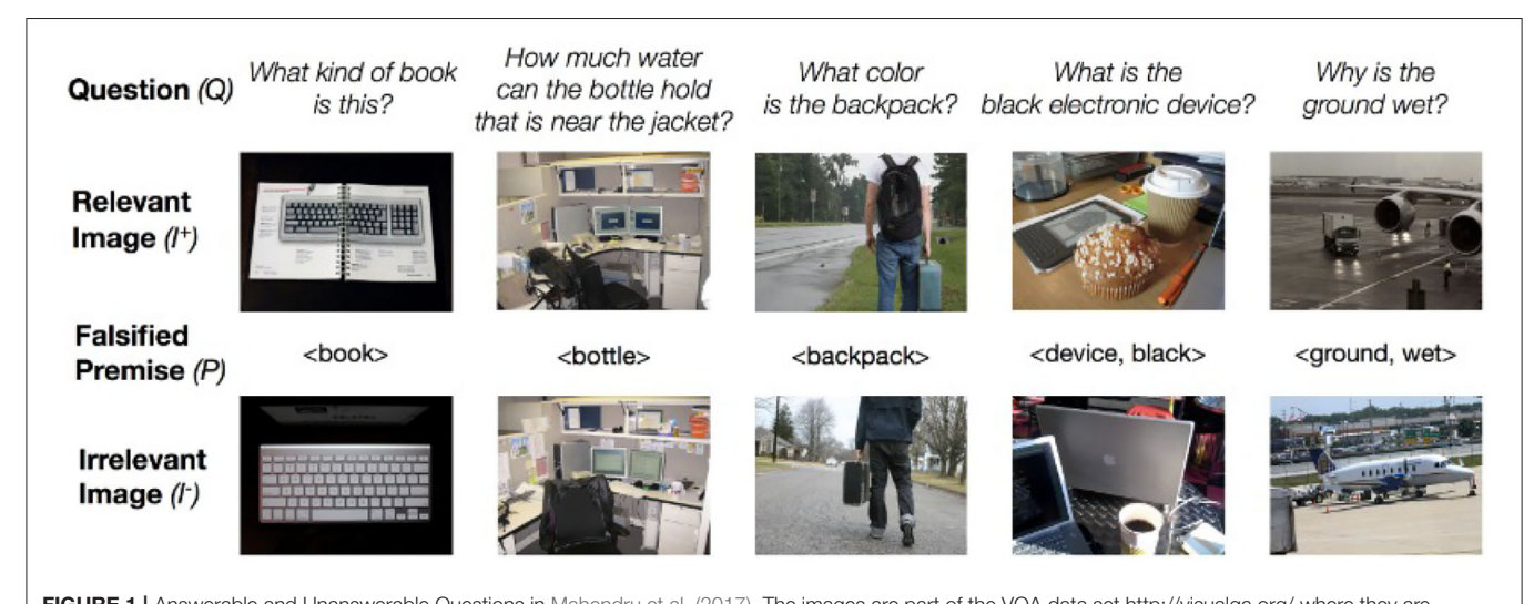
FIGURE 1 | Answerable and Unanswerable Questions in Mahendru et al. (2017). The images are part of the VQA data set http://visualqa.org/ where they are published under a Creative Commons Attribution 4.0 International License.

Some of the questions that I have put in categories V.1-V.4 and V.6 may well be in category V.5; that is, a sufficiently knowledgeable or perceptive viewer could answer them from the