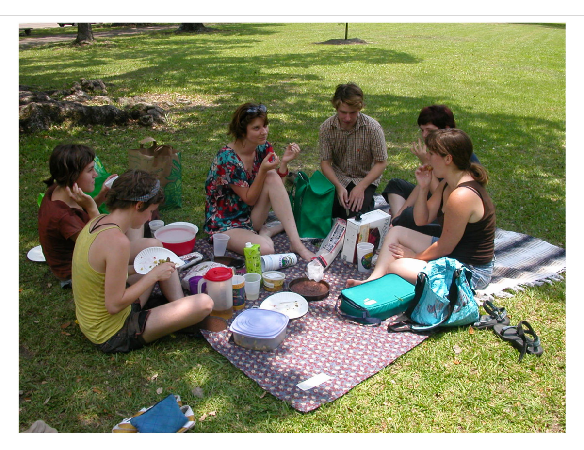
FIGURE 3 | Picnic.

QA datasets prior to SQuAD 2.0 had contained a fraction of questions that were unanswerable, due mostly to noise. These were mostly easy to detect as they did not have plausible answers. Jia and Liang (2017) had proposed a rule-based method for generating unanswerable questions; these were less diverse and less effective than the crowd-sourced questions created for SQuAD 2.0.