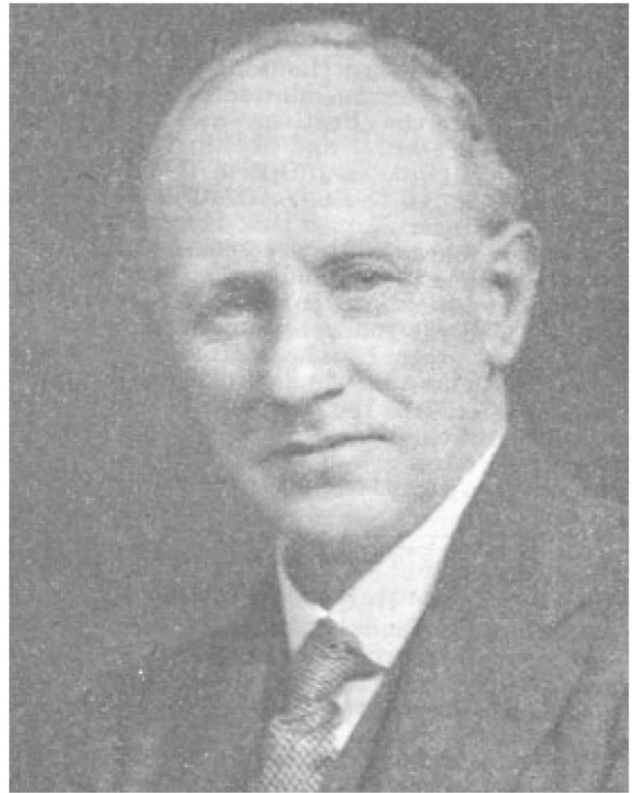
Figure 1 The only known photograph of Dr John Brownlee

As outlined by Higgs, 4 during the 19th century there were never-ending cycles of infectious diseases (cholera, diphtheria, erysipelas, measles, relapsing fever, scarlet fever (scarlatina), smallpox, tuberculosis (consumption), typhoid (enteric fever) and typhus) throughout the country, though their transmission was particularly easy amid the insanitary conditions in towns. Cases were not usually admitted to general hospitals for fear of spreading the infection, and isolation of patients was required though this was simply impossible in the cramped living conditions