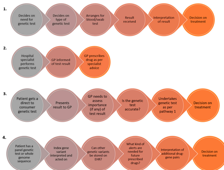
Figure 2. Four hypothetical pathways through which GPs may encounter pharmacogenetic tests within their primary care practice. Pathway 1 is where the GP initiates the test themselves; pathway 2 is where the genetic test is carried out in secondary care and the GP is informed of the test result; and pathway 3 is where the patient presents to the GP having undertaken a test privately or via a direct to consumer genetic testing laboratory. Pathways 1–3 represent situations where a single gene/variant test is undertaken for one gene-drug pair. Pathway 4 represents the situation where the patient has undergone a panel test or exome/whole genome sequencing, where there is the added complexity of storing the rest of the genetic data and having the ability to retrieve it, and use it appropriately in a pre-emptive fashion when a patient is prescribed a new drug(s).

The current literature demonstrates that many primary healthcare providers including physicians and pharmacists are hopeful about the role of PGx in enhancing the care of their patients [187,188] but often highlight that there are still multiple barriers impeding translation into daily practice [189]. Potential pathways of how GPs may encounter PGx tests are shown in Figure 2. Recent studies have identified that barriers to PGx implementation specifically within primary care include a perceived lack of evidence for clinical utility, unclear cost effectiveness and reimbursement strategies, how to educate the primary care workforce regarding PGx, unclear roles and responsibilities particularly between general practitioners and pharmacists, the need for informatics to support PGx-informed clinical prescribing decisions, and concerns over the principles of data sharing as well as other ethical, legal and social implications (ELSI) surrounding PGx [190,191].