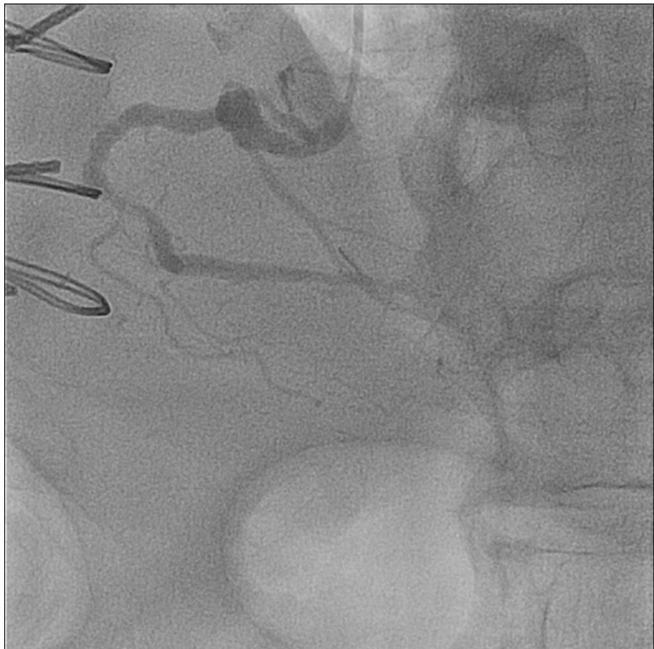
FIGURE 4: Coronary angiography of the right coronary artery in left anterior oblique cranial projection

Given his age, underlying comorbidities, and patent bypass grafts, we opted to treat him medically with optimization of medical therapy, which included anti-platelet, angiotensin receptor antagonists, and statins.