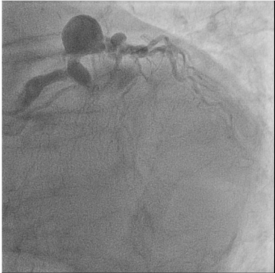
FIGURE 3: Coronary angiography revealing complete occlusion of the proximal left circumflex artery in left anterior oblique caudal projection

Bypass angiography revealed patent grafts to the LAD, obtuse marginal branch, and right coronary artery (RCA) (Figure 4).