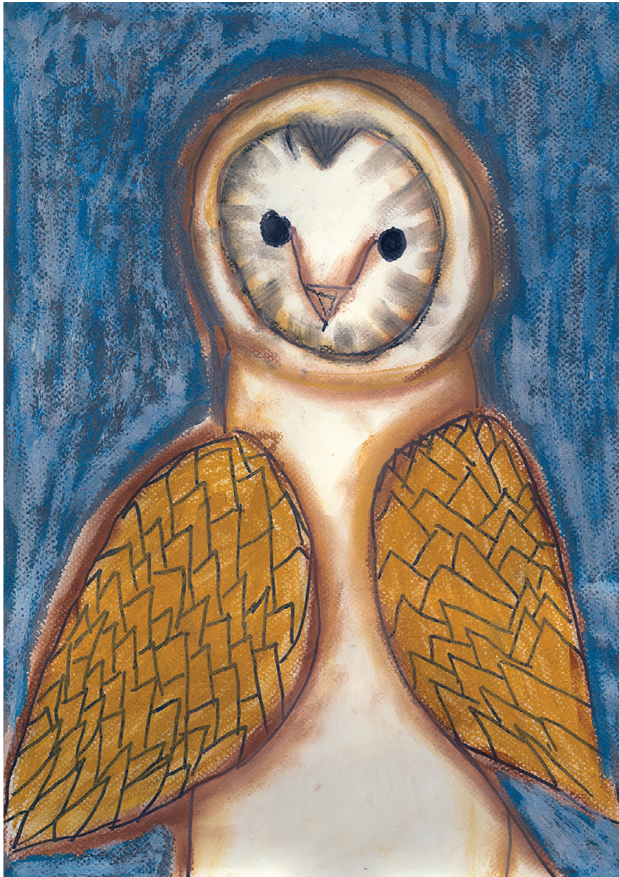
Owl of the Night by William Wang (7) from Operation Art 2020