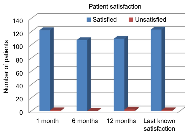
Figure 3 Patient satisfaction at 1-, 6-, and 12-months postoperative and last known satisfaction for each patient.

readjusted once each to achieve a completely flat alignment, without necessitating removal of the patch from the defect.