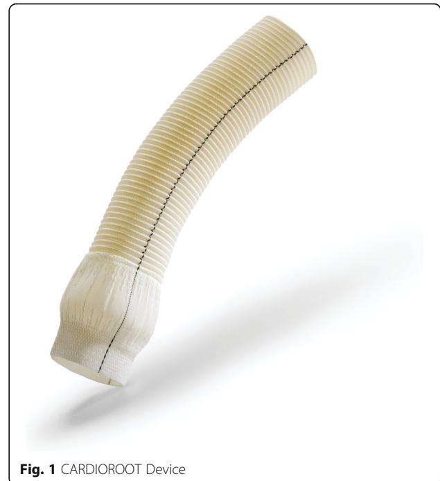
Fig. 1 CARDIOROOT Device

As a condition of commercial approval (Conformité Européenne mark) for the CARDIOROOT vascular grafts,