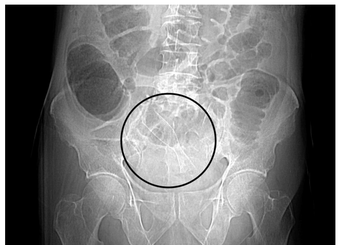
Figure 3. Circle shows properly positioned stent demonstrating typical hourglass appearance of stent.

The choice of which SEMS to use (with respect to length and diameter, as well as wire guided vs through the colonoscope) was tailored according to the characteristics of the stricture. A Wallstent (Boston Scientific) was the SEMS available at our institution. Most SEMSs were uncov-