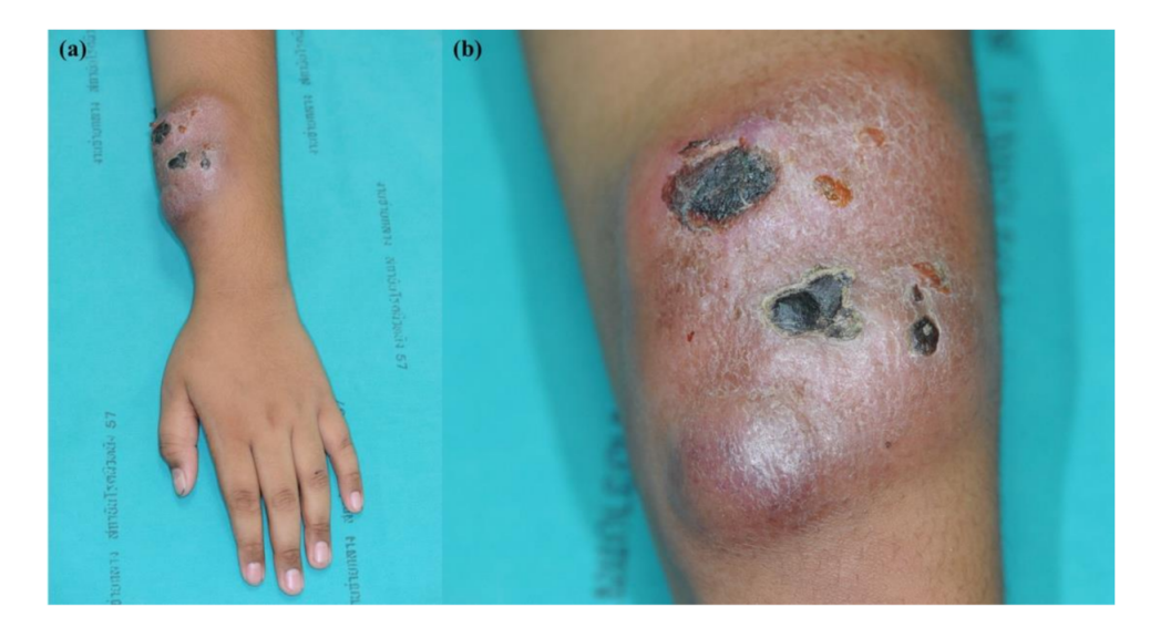
Figure 1. BPDCN ( a ) large solitary well-defined erythematous rubbery, fixed, non-tender mass on the left forearm, 8 cm in diameter; ( b ) ulceration and necrotic crusts.

A nine-year-old boy presented with a seven-month-old spontaneous enlarging erythematous subcutaneous tumor on his left forearm. Within one month, the lump gradually enlarged and ulcerated (Figure 1). The patient had no B symptoms. He had received oral doxycycline and clarithromycin for 10 days prior to consultation with no improvement. No other complaint or family history was obtained. Physical examination revealed a solitary, well-defined, large, erythematous, rubbery, fixed, non-tender mass with crusting on the left forearm, measuring 8 cm in diameter, and a non-tender left axillary lymph node, measuring 2 cm in diameter. Other physical findings were within normal limits. Differential diagnoses included chronic infection, lymphoproliferative disorder, lymphoma/leukemia cutis, and other non-hematologic tumors.