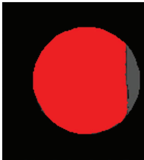
Figure 2: Image obtained using ImageJ in which the red color indicates the area of the glenoid within the best-fit circle.