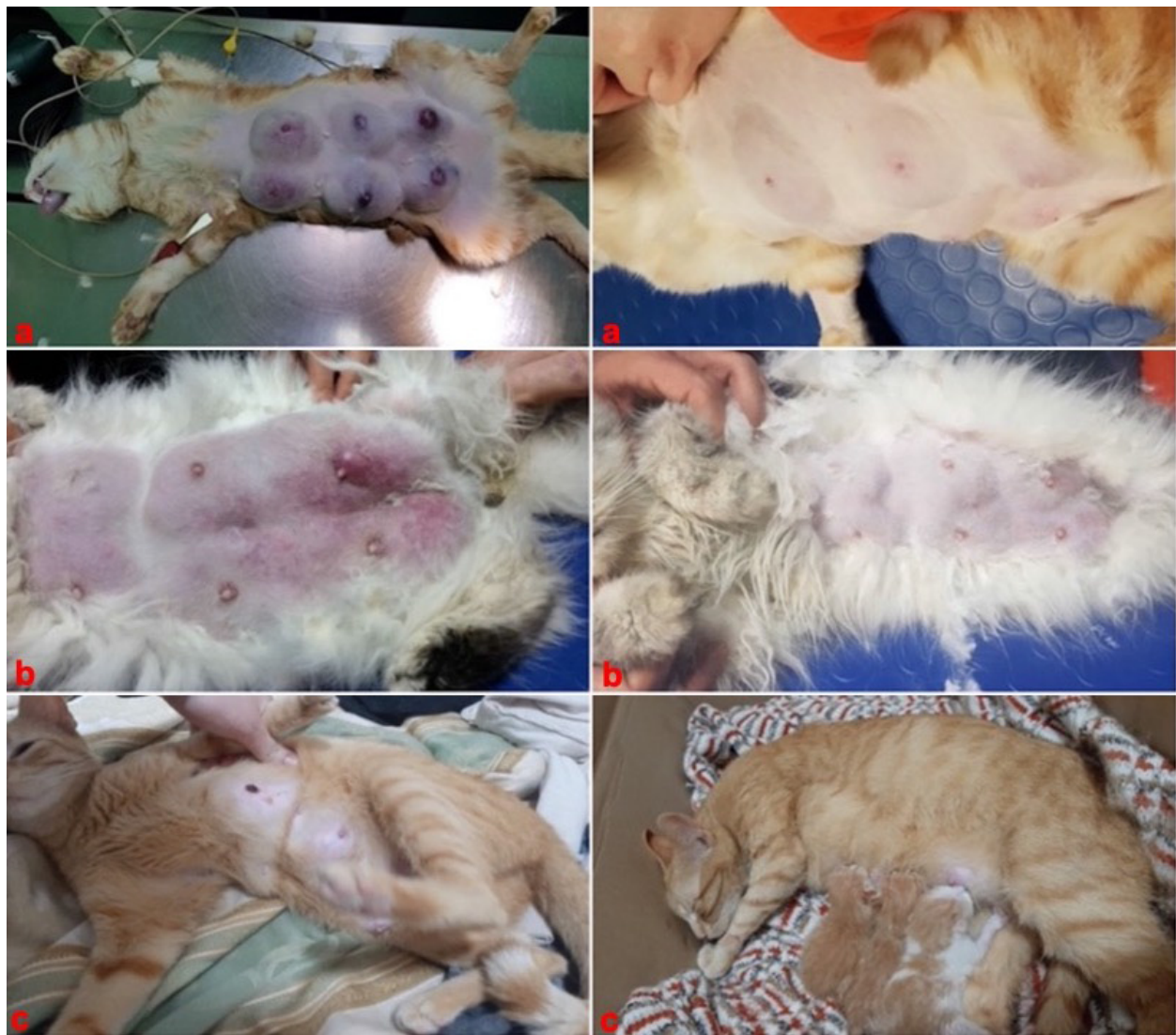
Fig. 1. (a) Case C1. Severe FAC with ulcers and painful glands. Resolution after 2–3 weeks with the proposed combination of drugs and nutraceuticals. (b) Case C7. A pregnant Persian female cat with enlarged mammary glands (FAC) and inflamed skin. 21 days after treatment note the mammary gland involution. (c) Case C8. A 1-years-old domestic shorthair female cat, exhibiting FAC with ulcers during pregnancy, treated without aglepristone to preserve litters.

the cytologic smears allowed to exclude malignant growth or mastitis. Ultrasound examination of the mammary gland and doppler was employed to evaluate the structure and vascularization of the enlarged gland. FAC presented mainly as a well-circumscribed solid mass of granular, slightly hyperechoic texture, with regularly delimited margins. There was a uniform distribution of vascularity. Anechoic areas were present in the parenchyma and outside the margins (Fig. 2). Owners gave their consent to conservative treatment to preserve fertility and the integrity of the mammary glands. Mastectomy was not performed in any cases. Non-pregnant cats (C1, C2, C3, and C4) were treated on two consecutive days with subcutaneous injections