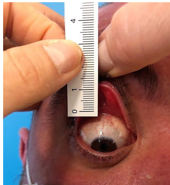
Figure 5. 'Upper eyelid distraction distance (UEDA)' test, measuring the distance from the posterior margin of the upper lid to the bulbar conjunctiva during eyelid distraction with the patient in down gaze position (12 mm).