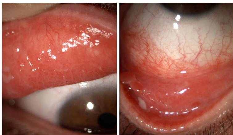
Figure 1. Superior and inferior tarsal papillary conjunctivitis associated with floppy eyelid syndrome.

for developing keratoconus in healthy subjects, as they lead to a reduction in corneal resistance and corneal hysteresis. Furthermore, the recurrence of hypoxic conditions may lead to anaerobic glycolysis and stromal acidosis, and may promote the transcription of pro-inflammatory cytokines, tumor necrosis factor- \alpha , or interleukin-6, leading to corneal thinning.