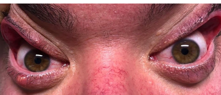
Figure 2. Eyelid laxity in bilateral floppy eyelid syndrome in a 45-year-old man affected by moderate obstructive sleep apnea-hypopnea syndrome.

Various methods have been used to quantify upper eyelid laxity, but currently there is not a gold standard for such evaluation. The McNab AA method 12 or ‘vertical lid pull/distraction test’ is the