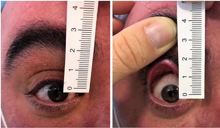
Figure 6. 'Vertical hyperlaxity' test measuring the distance between the palpebral rim and the center of the pupil during vertical traction of the eyelid (19 mm).