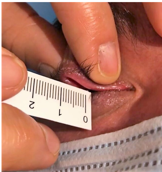
Figure 7. 'Upper horizontal distraction' test, measuring the distance between the anterior corneal pole and the anterior distracted upper eyelid.

Liu et al. 37 classified FES into three groups based on the amount of the upper tarsal conjunctiva (UTC) visible after eversion of the upper eyelid: