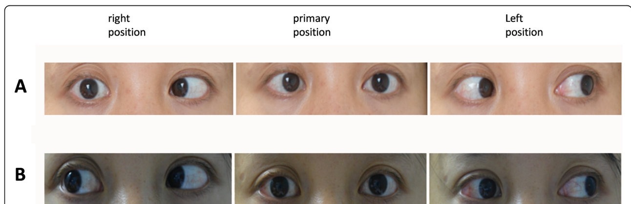
Fig. 1 Typical case of a near complete recovery of abduction in a patient with complete sixth cranial nerve paralysis after a serious traumatic fall. A. Clinical picture demonstrating that a 35 PD esotropia in the right eye which could not move across the midline before surgery. B. Two months after a 7 mm medial rectus recession and a 13 mm lateral rectus resection, the patient showed normal ocular alignment and only -1 underaction of abduction in the right eye

To substantiate results from this microarray expression profile and assess differences between the two groups 10 genes (PAX7, MYOD, MYOG, MYF5, CXCR4, PITX1, SIX1, SIX4, VCAM1, ITGA7) related to the differentiation