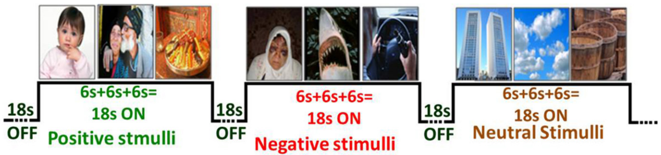
Figure 1 Blood oxygenation level-dependent functional magnetic resonance imaging paradigm components showing the main emotional tasks (positive, negative, and neutral).

Each emotional task was repeated three times with unique images, e.g. each picture was displayed once.