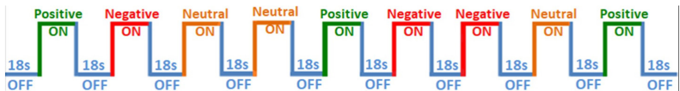
Figure 2 Block design paradigm showing the arrangement of the emotional tasks (positive, negative, and neutral).

Each emotional task was repeated three times with unique images, e.g. each picture was displayed once.