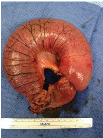
FIGURE 2: Operative specimen of small bowel intussusception.

for 5-hydroxyindole acetic acid measured were elevated (10.8 mg/L). In 6-month postoperative follow-up visit, patient is doing well without any complications.