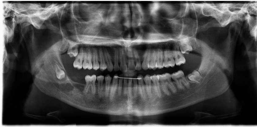
Figure 5. Panoramic radiography one year later: A complete mandible bone healing.