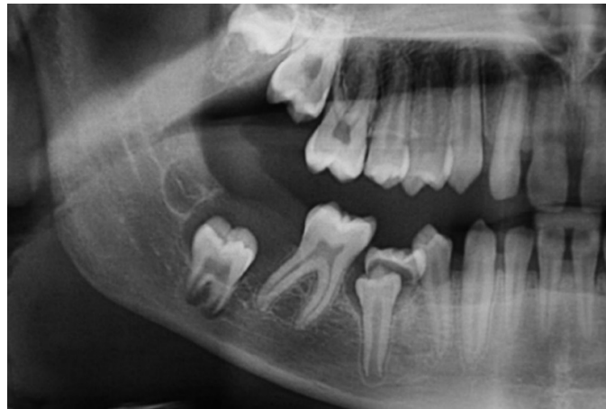
Figure 2. Panoramic radiography made at the age of thirteen: A unilocular well-defined radiolucent lesion (measuring around 4 mm) surrounding impacted mandibular right second molar.