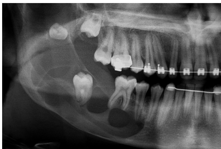
Figure 1. Panoramic radiography: A well-defined multiloculated radiolucent lesion involving impacted mandibular right second molar.

A 16-year-old male was referred to the Centre for Diagnosis and Treatment of Oral Diseases with a clinical diagnosis of ameloblastoma having hemi-mandibulectomy as the suggested therapy. At admission, no relevant aspects within his medical history were observed. He brought a panoramic radiography (Figure 1) which revealed the presence of a multilocular lesion involving the impacted mandibular right second molar suggesting mainly an ameloblastoma or an OKC. It extended from the right mandibular notch to the lower right first premolar. A displacement of the mandibular canal and the lower right third molar towards the mandibular notch was also observed. We had access to another radiography taken at the age of thirteen, which presented a well-defined sclerotic area around the crown of the mandibular right second molar suggesting a hyperplastic dental follicle or a dentigerous cyst (Figure 2). During those three years, the patient did not consult. Intraoral examination revealed a slight painless swelling of the buccal and lingual cortical extending from the lower right first molar region to the mandibular branch (not shown).