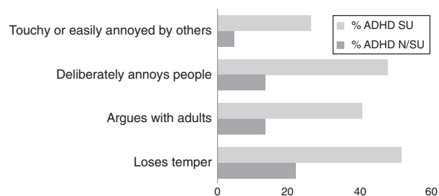
Figure 1 Percentage of presence of specific ODD symptoms in ADHD adults with and without substance use. ADHD-SU = ADHD with substance use; ADHD-N/SU = ADHD without substance use; ODD = Oppositional defiant disorder.

There were also differences between the groups in some specific CD symptoms: "Stealing items of nontrivial value without confronting victim" [ \chi^2(1, N=50)=5.81, p=.016 ];