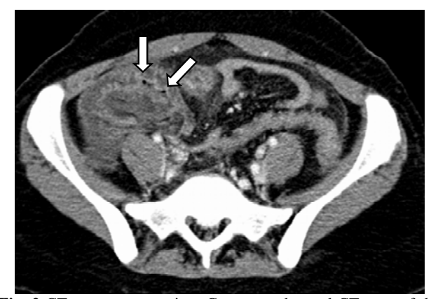
Fig. 2 CT scan cross section. Contrast enhanced CT scan of the same patient showing thickened cecal wall with air luscencies consistent with pneumatosis intestinalis (arrows).