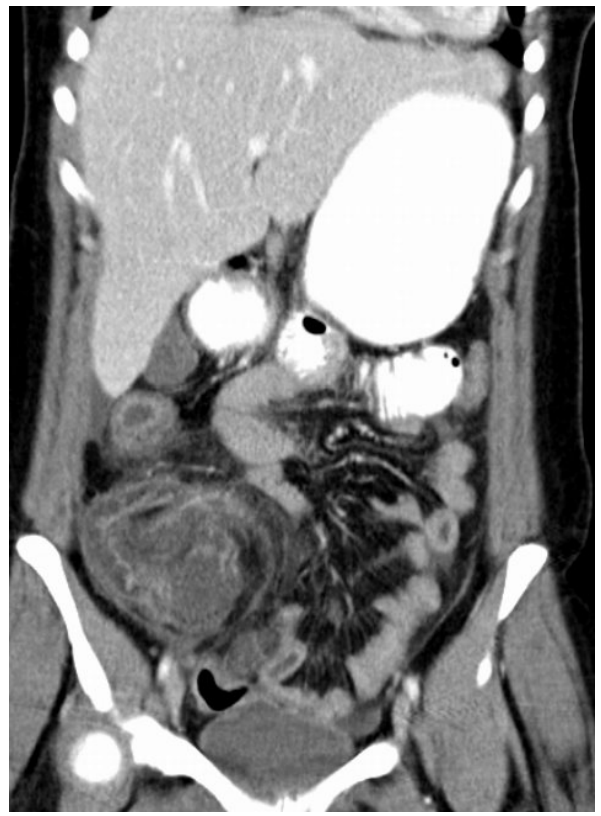
Fig. 1 Coronal CT scan image. A coronal CT scan image of a patient with neutropenic enterocolitis 10 days following chemotherapy for breast cancer. The cecum and ileum is grossly thickened with obliteration of the lumen.