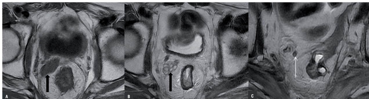
Figure 1 - Left SV agenesis of a 63 years old male patient who had colon ca. Axial (a) T1 weighted MR image, axial; (b) T2 weighted MR images show left SV absence. Right SV normal (thick black arrow). Axial (c) T2 weighted MR image show; SV absence was associated with left VD absence. Right VD normal (white thin arrow). Postoperative changes at the anastomosis line of the rectosigmoid junction.

SV = Seminal vesicle; VD = Vas deference