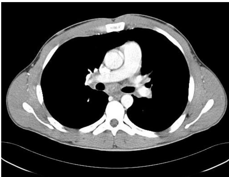
Fig. 3: The CT image shows the increase of mediastinal lymph nodes

except one month of detraining was advised. He was in a fairly good physical state thirty days later, and the follow-up exams didn’t show any more progression of the disease. He gradually restarted his training after four months and he actually was in good performance.