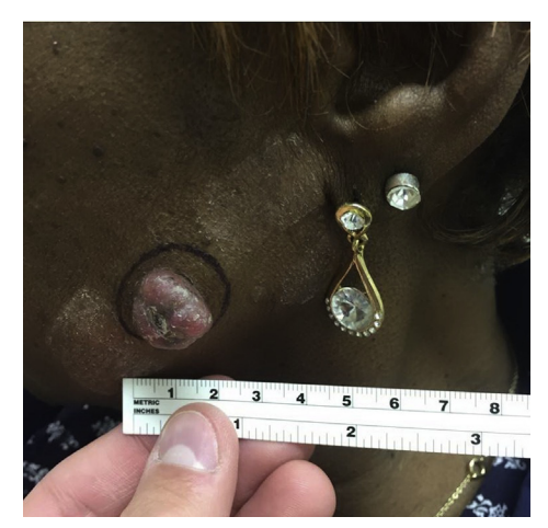
Fig 1. Pilomatrix carcinoma on the left cheek (case 1).