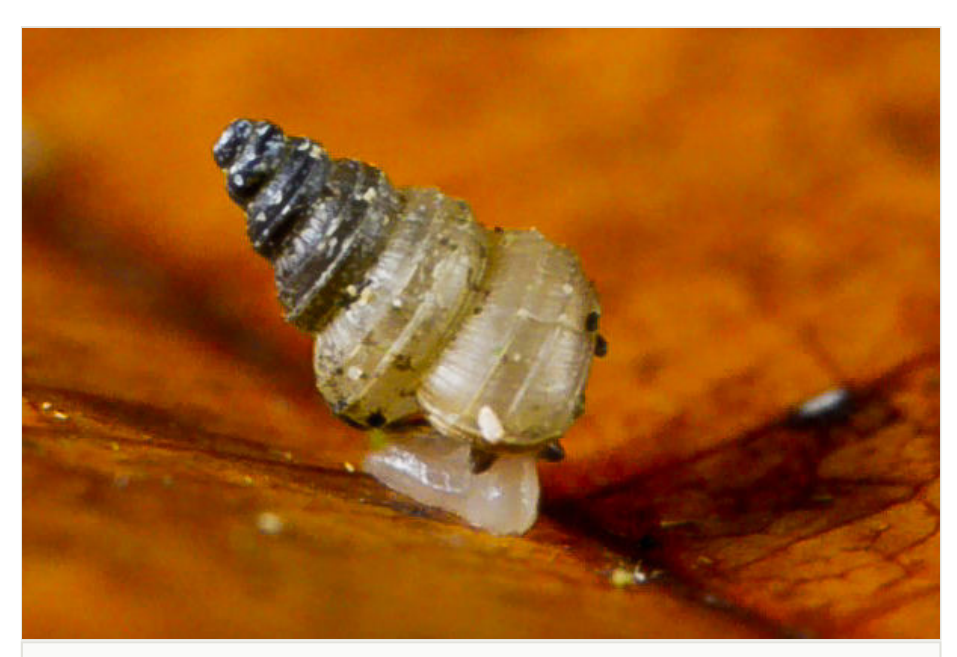
Figure 2. doi Active individual of Craspedotropis gretathunbergae n. sp. (paratype, IBER-UBD 7.00142), taken from a video file (Suppl. material 1).