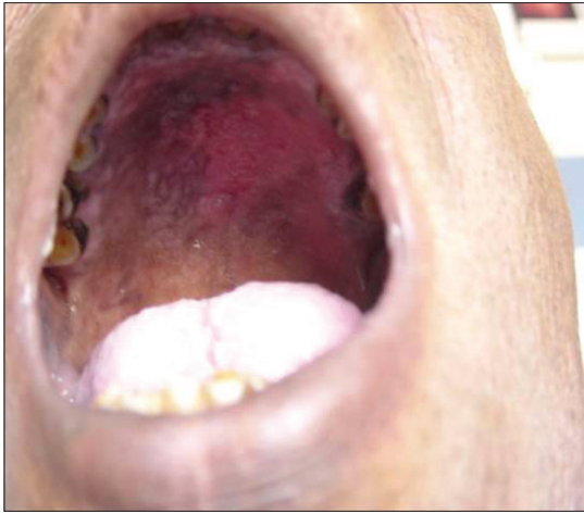
Figure 5: Response after external cobalt therapy, showing complete clearance of oral ulcer

and the breast is the most frequent primary site of carcinoma in women that metastasize to the skin. In addition, there may be a long time lag between the diagnosis of the primary neoplasm and recognition of the skin metastases. [3] Even in our case, the appearance of zosteriform lesions over the neck, which mimicked cutaneous metastases, made us investigate for any internal carcinoma and we found a squamous cell carcinoma over the hard palate, which was an unusual site with no previous similar reports in literature.