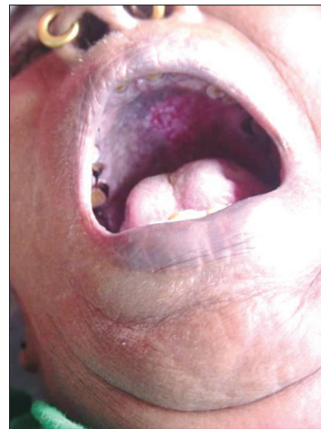
Figure 2: A superficial ulcer of 2 x 2 cm over the hard palate in the oral cavity with an eroded surface with irregular margins and pseudomembrane formation