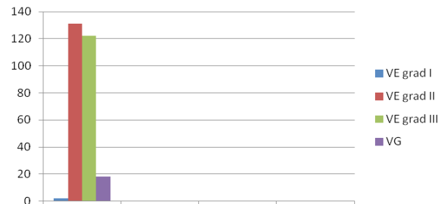
Figure 2. Variceal bleeding depending on the grade of the varicose veins - in a graphic form.

in patients with varices grade II and III. In our series there were 2 patients (0.73%) with bleeding from esophageal varices grade I, 131 patients (47.98%) with hemorrhage from esophageal varices grade II and 122 patients (44.7%) with bleeding from varices grade III. Gastric varices hemorrhage was found in 18 patients (6.59%) (Figure 2).