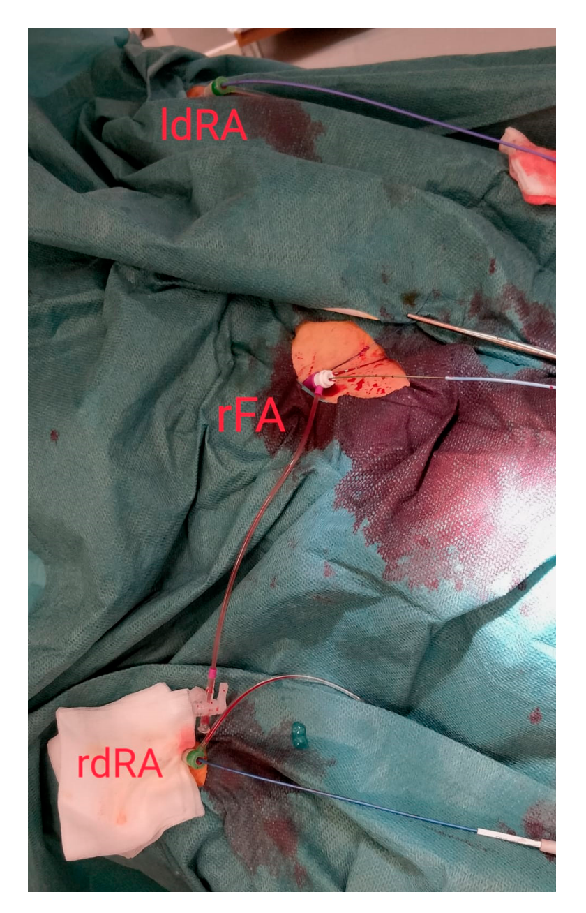
Figure 2. Increased ergonomics during TAVI: dual right (rdRA) and left (ldRA) distal radial access, with the main femoral access in the center (right femoral artery—rFA).