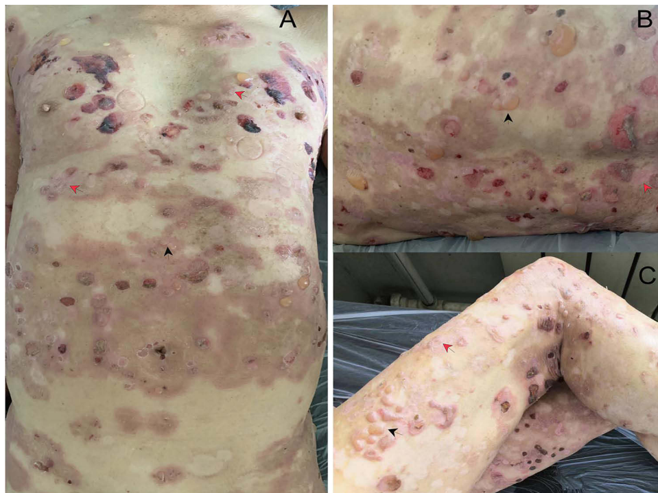
Figure 1 Generalized infiltrative erythema and plaques, tense vesicles and blisters on the trunk and extremities (Red arrows mark some of the typical psoriatic lesions, and black arrows mark the lesions of BP). Blisters basically appear on psoriatic lesions (A). Erosions and crusts mainly observed on his back and legs (B and C).

of BP180 (200RU/mL), BP230 (141.51 RU/mL), white blood cell count ( 12.11 \times 10^9/L ), eosinophils ( 2.87 \times 10^9/L ), C-reactive protein (78.18 mg/L), erythrocyte sedimentation rate (20mm/h), creatinine (124.11 \mu\text{mol/L} ) and immunoglobulin E (IgE) level (710.6IU/mL). Skin biopsies obtained from the vesicular lesion revealed subepidermal blisters accompanied by a small quantity of inflammatory cell infiltration. Furthermore, a minor infiltration of lymphocytes and eosinophils was detected surrounding the superficial dermal vessels (Figure 2A). Direct immunofluorescence (IF) showed that immunoglobulin G (IgG) and C3 were linearly deposited at the basement membrane zone (BMZ) (Figure 2B). The patient was diagnosed with bullous pemphigoid (BP), psoriasis vulgaris (PV), and gout.