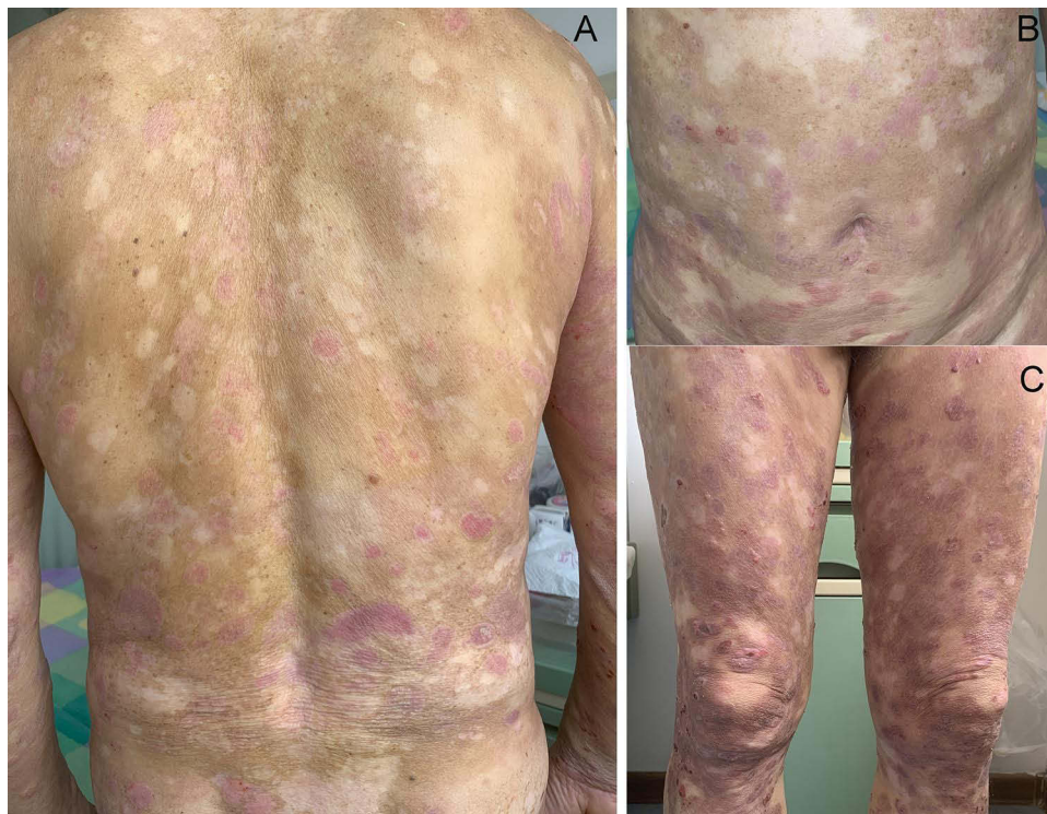
Figure 3 After 16-day treatment, the lesions of both psoriasis and BP largely subsided. Erythema, plaques, and blisters on the trunk have basically resolved ( A and B ). Dark erythema, plaques, and a few crusts are present on the legs ( C ).

BPDAI score was 2 (96% improvement) ( Figure 3 ). However, due to financial constraints, the application of dupilumab was discontinued, and he was treated mainly with topical corticosteroids and vitamin D3 analogs. No lesions of psoriasis or BP appeared during the six-month follow-up period.