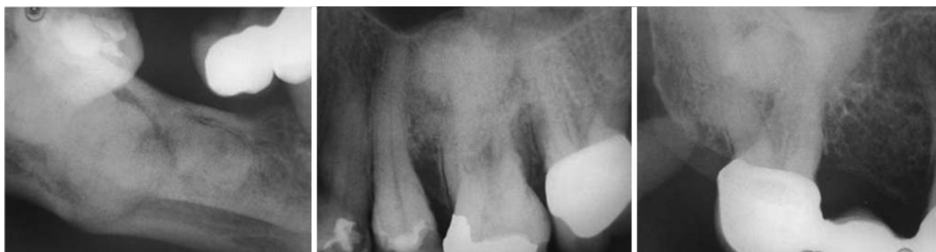
Fig. 1. Periapical radiographs reveal dense, amorphous, radiopaque masses.

plays a vital role in diagnosing these lesions. Panoramic radiographs exhibit a multi-quadrant appearance that is characteristic of these radiopaque masses. Three-dimensional (3D) radiological imaging modalities like cone-beam computed tomography (CBCT) provide more detailed information by virtue of their ability to produce axial, coronal, and sagittal views.