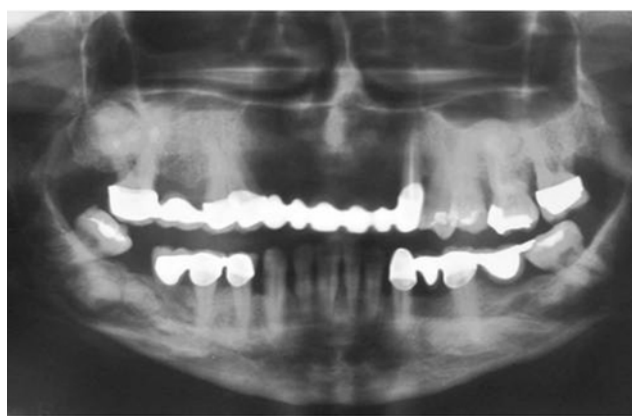
Fig. 2. A panoramic radiograph shows the mixed radiolucent/radiopaque masses with a cotton-wool appearance and with the entire border in three quadrants.

A lesion was found incidentally on routine periapical radiographs taken for the restored teeth and edentulous areas (Fig. 1). Radiopaque masses were coincidentally observed in the periapical radiographs but the exact boundaries of the masses could not be seen. For further and more detailed examination, cone-beam computed tomography (CBCT) and a panoramic radiograph were taken. The panoramic radiograph and CBCT revealed maxillary bilateral and symmetrical, well-defined, round, radiopaque masses in contact with the root of the maxillary right second molar and left first molar teeth. Lobular, irregularly shaped radiopacities with clear radiolucent demarcation were also present in the right edentulous mandibular molar area (Figs. 2 and 3). The bucco-lingual aspects of the lesions were best