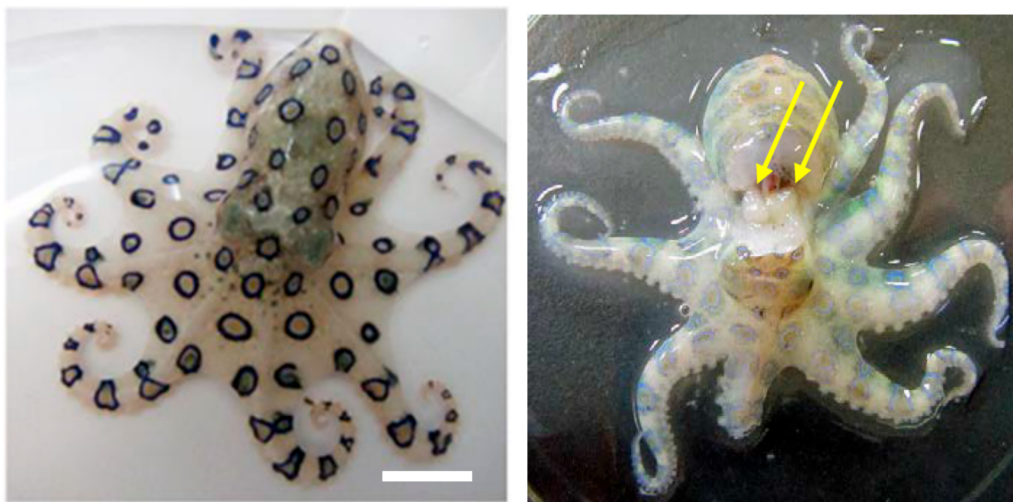
Figure 3. Greater blue-ringed octopus Hapalochlaena lunulata from Ishigaki Island, Okinawa Prefecture, Japan. (A) Living whole body. White scale bar = 1.0 cm. (B) Location of the posterior salivary glands (yellow arrows).