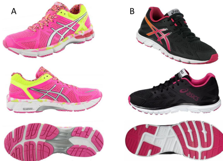
Fig. 1 The high-support shoes (ASICS Kayano-GS, a ) featured a medial post, < 10^\circ torsional stiffness, < 10^\circ heel counter stiffness and < 45^\circ midfoot longitudinal stability. In contrast, the low-supportive shoes (ASICS Zaraca 3, b ) featured a uniform midsole density, 10\text{--}45^\circ torsional stiffness, 10\text{--}45^\circ heel counter stiffness and > 45^\circ midfoot longitudinal stability

single limb drop lateral jump (DLJ, Fig. 2). For each participant, jump height was scaled to a relative box height of 30% of their lower limb length, measured from the outermost lateral aspect of the greater trochanter to the floor. We normalized box height to individual limb anthropometry, to create similar neuromuscular demand between participants, as an individual's jump/landing height increases during adolescent years [36].