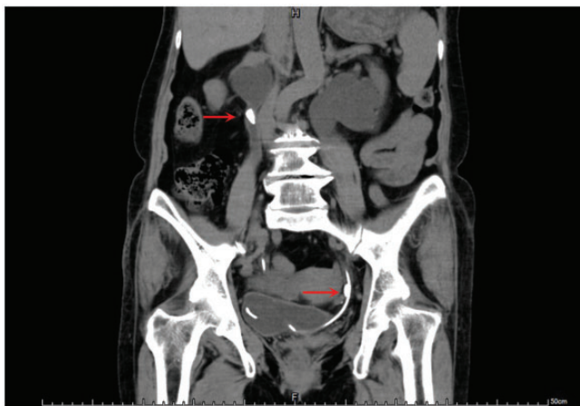
Figure 1. Representative coronal computed tomography scan image demonstrating hydronephrosis and calculus detected in bilateral ureters. The arrows mark the stone locations.

Percutaneous nephrolithotomy was performed to treat stones in the right ureter. Direct puncture was attempted twice due to bleeding in the first tract. A second F16 percutaneous tract was created for the surgeon to break the stone using a holmium laser (VersaPulse™ PowerSuite™ 80/100 W Holmium Laser, Boston Scientific, Marlborough, MA, USA). The stone crusher and power of the laser was set at 1.0 J/20 Hz, and a perfusion fluid pump was used with pressure set to no more than 300 mmHg. Affected by bleeding in the first channel, a high perfusion pump flow rate was applied to ensure clear vision.