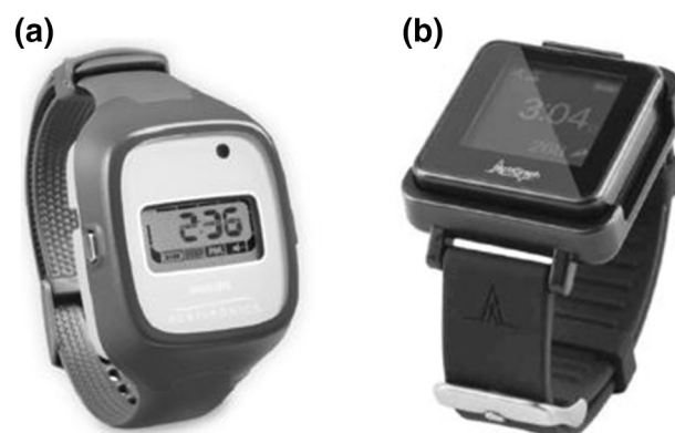
Fig. 2 Examples of wearable medical-grade actigraphy devices, including a Actiwatch Spectrum watch [70], and b the ActiGraph Link GT9X [71]

disturbances [50]. Furthermore, while actigraphy is an objective measure of movement, it is unable to detect the level of energy expenditure or exertion related to physical activity [65].