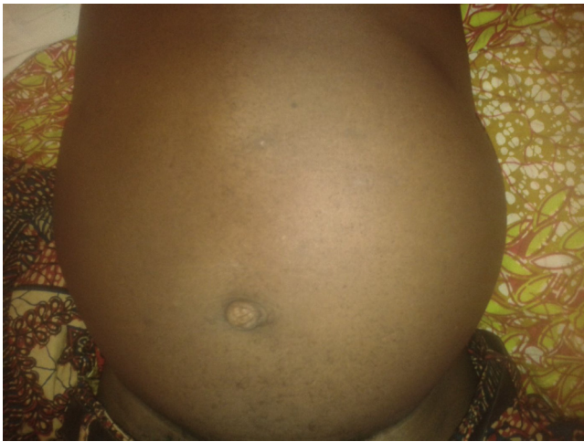
Figure 1. Abdomen distended and distorted by a mass of the left flank in 72 years old man.

Abdominal ultrasonography showed heterogeneous tissue formation of the left renal lodge displacing neighboring structures. At the CT scan the mass was enhanced heterogeneously and was located in the upper pole of the left kidney; measuring 79 mm × 85 mm. On the series without injection, we observed a relatively discrete peripheral hyperdense area surrounding the gland which corresponded to a perirenal hematoma (Figs. 2 and 3). Neither thrombus image in the renal vein and the vena cava nor transfer lesions were observed. The massive deglobulization in our patient and the suspicion of a pre-existing renal tumor motivated the decision to nephrectomy in order to preserve the patient's vital prognosis.