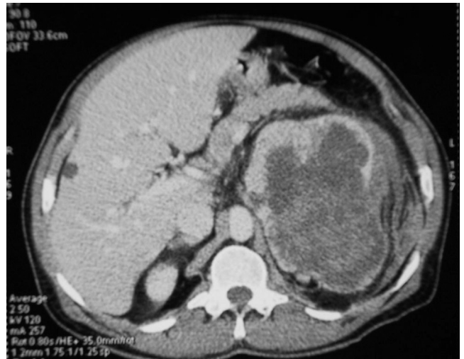
Figure 3. Axial view showing large mass of the left kidney.

To correct the bleeding, the patient received a transfusion of whole iso group iso rhesus blood. We then performed a left radical nephrectomy with ganglionic dredging by median laparotomy. The postoperative features were simple. Pathological examination of the surgical specimen revealed a papillary renal cell carcinoma grade 2 (type 1) according to Fühman (Fig. 4). The classification according to UICC 2009 was pT3N0M0.