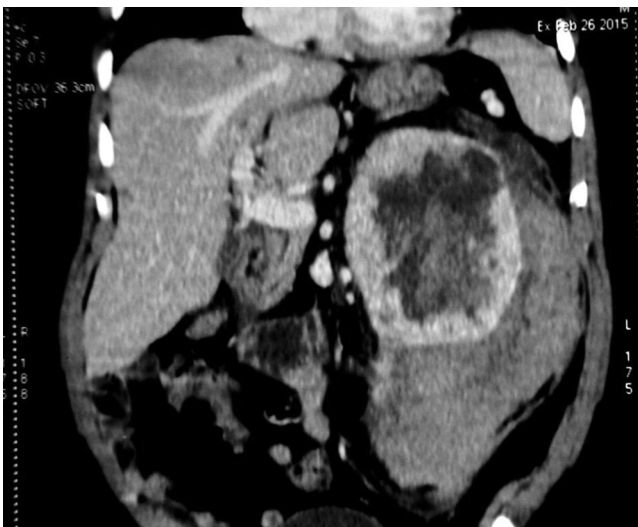
Figure 2. Necrotic tumor of the left kidney and perirenal hematoma.

Papillary carcinoma has the particular nature of being a necrotizing tumor especially when it is type 2; while type 1 papillary masses can take the appearance of a cystic formation. This explains the fragility of papillary tumors, and spontaneous breaking-offs have been reported. 3 This fragility explains the large hematoma occurred in our patient as a result of a minor traumatism.