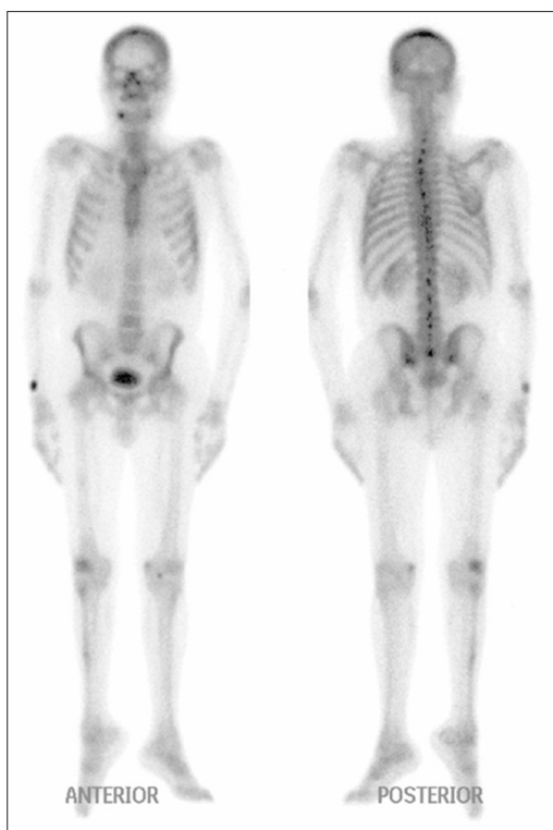
Figure 1: Anterior (left) and posterior (right) projections of whole-body bone scintigraphy. The scan demonstrates a congenital anomaly of the scapula, as called Sprengel's deformity. Otherwise, the study was negative for bone metastasis

Although congenital anomalies of the scapula are rare, the most common of which is which can be associated with other skeletal deformities (e.g., vertebral and rib deformities, spinal scoliosis, and spina bifida). [2,6,7] To date, the embryogenic etiology of SD has not been convincingly elucidated. [2,8] SD has been classified as low- to high-grade according to the severity of deformity. [2,3,8] Scapula is usually hypoplastic or dysplastic with abnormally elevated position. [2,3,6,8] The scapula on opposite side is usually normal, therefore shoulders appear asymmetric. [2]