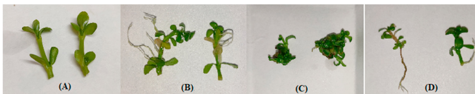
Figure 2. The morphology of harvested Bacopa monnieri , under different experimental conditions; (A) MS + white light, (B) Leafy 200 hydroponic media + white light, (C) MS + B/R light, (D) 'Leafy 200' hydroponic media + B/R light.