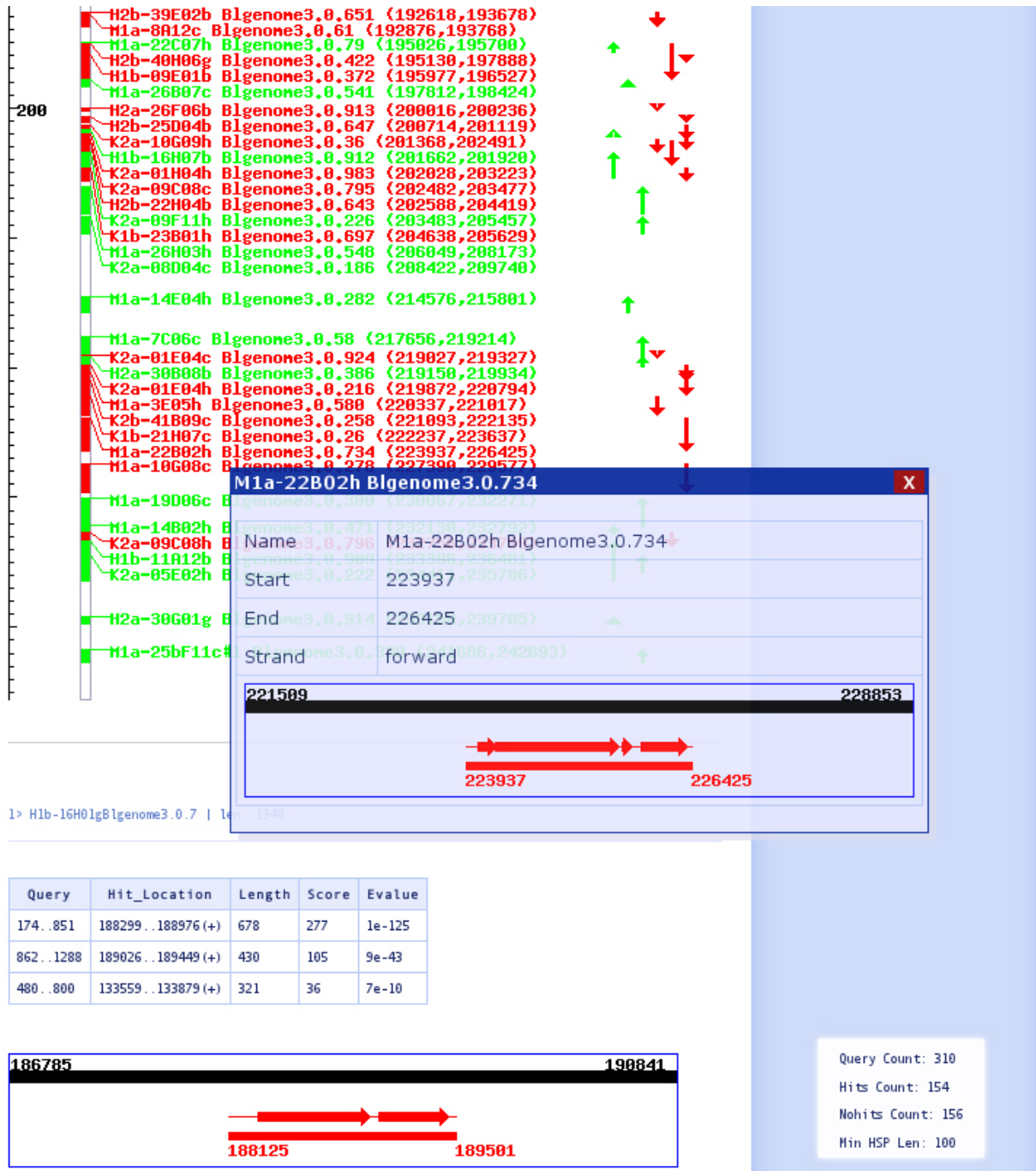
Figure 2 Mapping of Blattabacteria short ESTs onto a moderate related genome template. In the example, JANE maps a high fraction of ESTs to moderately related genomes (at least 80% rRNA identity/60% household enzyme similarity) with about 80% accuracy. The number in the left scale indicates the location in the genome template (in kilobases). All mapped ESTs are listed. Arrows in different colours (right) mark the consensus regions of mapping, i.e., red indicates the forward strand and green the reverse strand. A statistical report analyzes the mapping result (right corner). The inserts at the bottom show that by clicking on an individual EST detailed analysis is possible, the different HSPs used and their position appear. This includes also a list of all HSPs available as well as the chosen best EST match generated by JANE. Further analysis regarding all ESTs of that region, contig prediction, coding sequence and function prediction is also provided (see text). More details on the program options and an actual screen shot are given in Fig. S1.