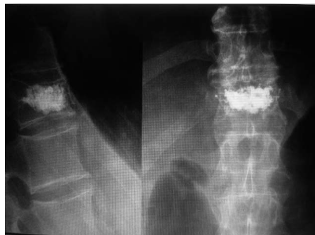
Fig. 3. Postoperative X-rays showing cement leakage anteriorly after bipedicular kyphoplasty procedure.