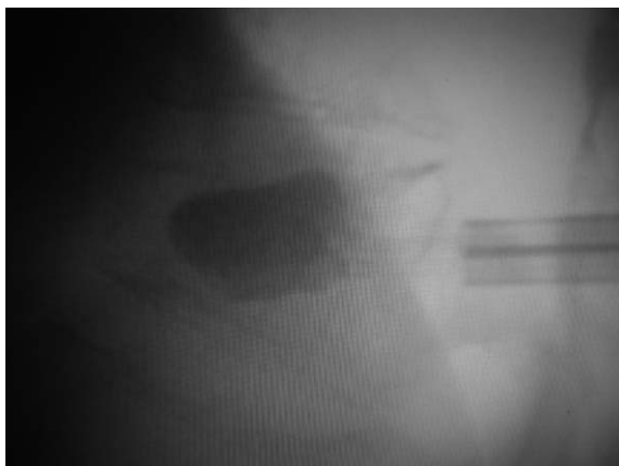
Fig. 2. Intraoperative X-rays of bipedicular kyphoplasty.

The kyphotic deformity in group A observed a mean value of 7.6^\circ at 1 month and 7.7^\circ at 3 months of follow up (the postoperative mean value, 7.4^\circ ), while in group B there is a mean value of 9.0^\circ at 1 month and 8.9^\circ at 3 months (the postoperative mean value, 7.9^\circ ). We conclude that the better kyphosis correction observed postoperative in both kyphoplasty groups is lost during the first month (about 1^\circ of correction) and after that it remain unchanged at 3